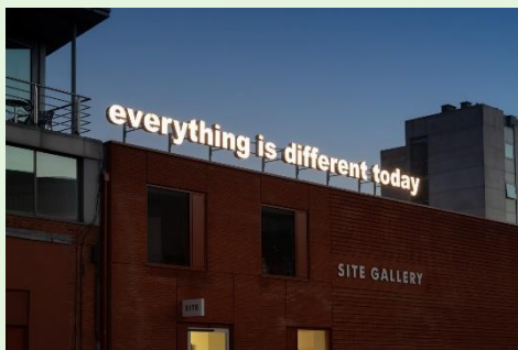
1 SITE Gallery, Sheffield

Site Gallery in Sheffield specialises in new media, moving image, and performance. It provides a space and a platform for emerging artists in Sheffield, the UK, and internationally. Its seven staff have huge international ambition, and before the referendum they had worked intensely across the world – in Europe and with the USA and Korea. Site runs a residency programme for local artists, who get the opportunity to travel throughout the scheme to make international connections; and Europe offers ideal destinations for doing that, in part because