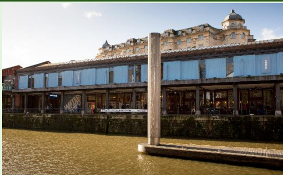
3- Watershed Exterior

The British film industry has been alerting the government and the public to the harmful impact of the UK's departure from the EU since the start of the referendum campaign. According to the EU network Europa Cinemas, a harsh Brexit deal could mean that admissions to cinemas in the EU to see UK-made films and to cinemas in the UK to see European films fall by six million admissions in one year (Europa Cinemas 2019). 12