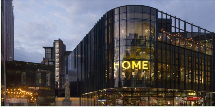
2 HOME, Manchester

The multiple art form venue HOME is located in Manchester, a city that voted to remain in the EU and which has benefited from EU funding for its cultural sector. For example, between 2007 and 2013, the National Football Museum, which has 750,000 visitors each year, received £3.8 million from the EU; and the People's History Museum